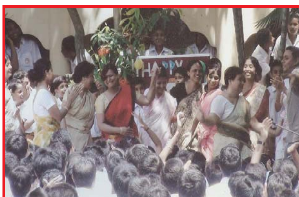
Teachers and Student of MVM Guwahati Celebrated Teachers' Day