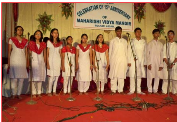
Students of MVM Silchar Presented Group Song on the occasion of 15 th Foundation Day.

On 5 th September 2010 MVM Silchar has celebrated its 15 th year of establishment. On this Occasion they have also released school magazine "Effort". Deputy Commissioner of Cachar District & MLA Silchar were present on the occasion.