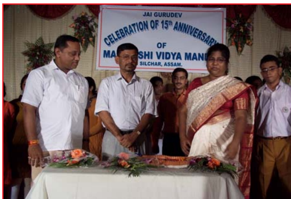
Guest of Honor Deputy Commissioner of Cachar District & MLA of Silchar on the occasion of 15 th Foundation Day of MVM Silchar.