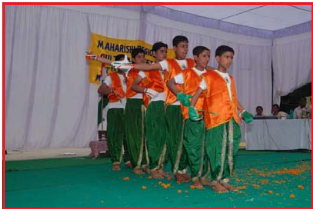
Students of MVM Presenting Group Dance on the Occasion of Maharishi Regional Cultural Celebration at MVM, Naini Allahabad.