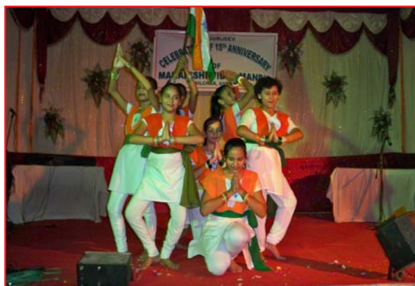
Students of MVM Silchar Presented Group Dance on the occasion of 15 th Foundation Day.