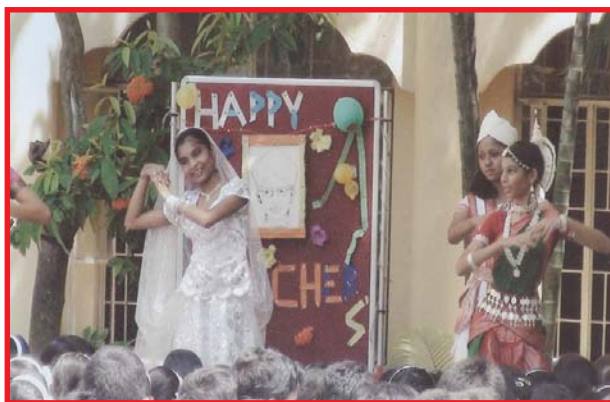
Student of MVM Guwahati Presenting Cultural Programme on occasion of Teachers' Day