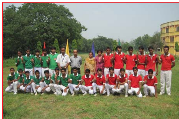
Students of MVM Maharishi Nagar, of Vashishth House with Principal, Sports Teacher and House Captain

KARATE CHAMPIONSHIP — 5 th Renbukai National Karate Inter School Championship was held at the Noida stadium, Sector -21 on 5 th September' 2010.