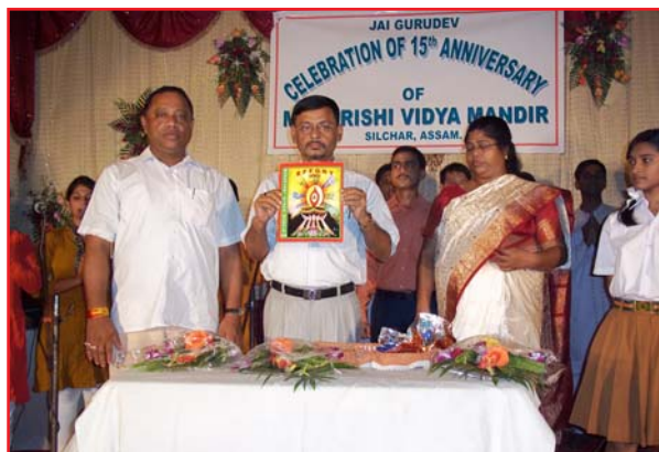
Deputy Commissioner of Cachar District & MLA of Silchar released School Magazine "Effort" on the occasion of 15 th Foundation Day.