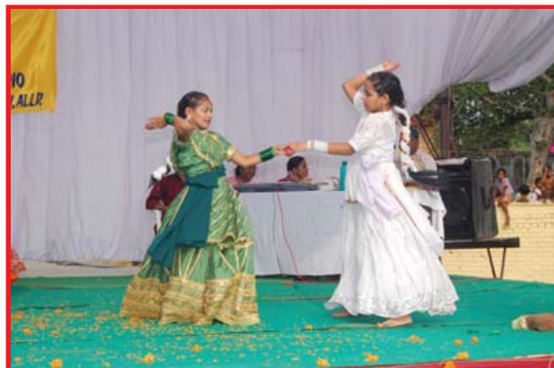
Students of MVM Presenting Folk Dance on the Occasion of Maharishi Regional Cultural Celebration at MVM, Naini Allahabad.