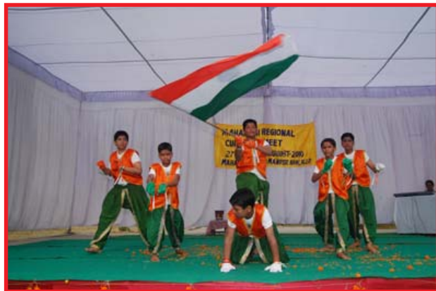
Students of MVM Presenting Group Dance on the Occasion of Maharishi Regional Cultural Celebration at MVM, Naini Allahabad.