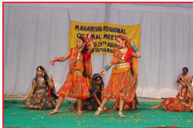
Students of MVM Presenting Folk Dance on the Occasion of Maharishi Regional Cultural Celebration at MVM, Naini Allahabad.