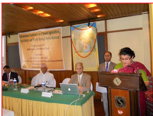
Address by the Chief Guest Mrs. Sujatha Koirala, Hon'ble Dy. Prime Minister of Nepal

Deputy PM Koirala inaugurated the "International Conference on Organic Agriculture, Food Safety and Purity through Vedic Science" on September 24 by declaring that "organic agriculture is considered the most pure, safe, and environmentally friendly method of agricultural development. In countries like ours where religious and social tradition play important roles in social policies and life style, the Vedic organic agriculture system offers positive hopes and successful examples for scientific agricultural development."