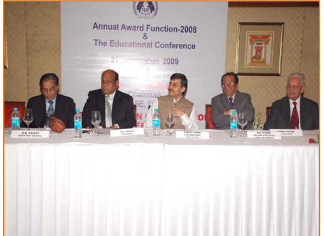
Members the Federation of Educational Publishers in India, present in Award Ceremony.