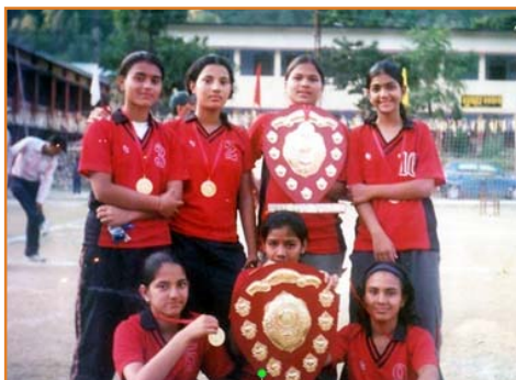
Winner State Level Volley Ball - 2008 Junior Under 17