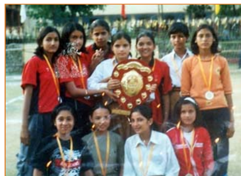
Runner State Level Volley Ball - 2008 Sub-Junior Under 14

* Declared best school in sports activities 2008-2009 at state level.